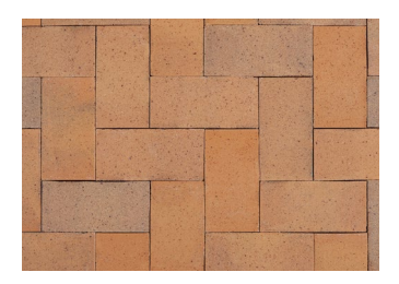
470-479 Light Range*