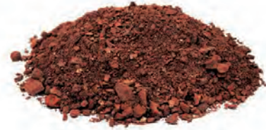
Dark Red Fine