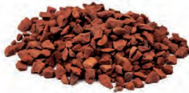
Dark Red Medium