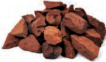
Dark Red Coarse