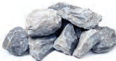
#1 & 2 Limestone