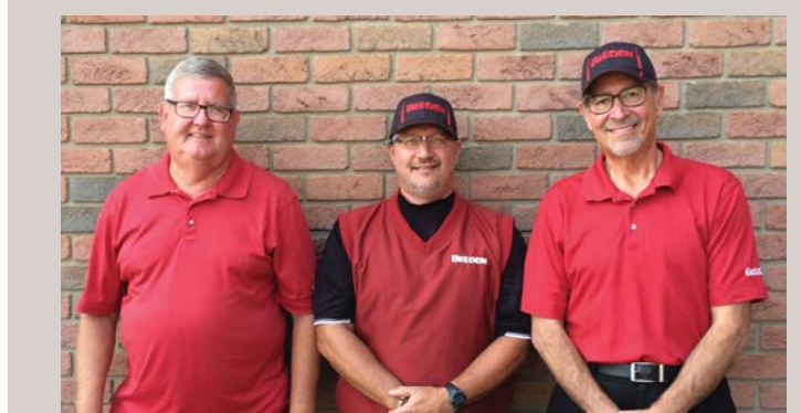
2nd Place was Captured by Two Teams. (10 Under) Shot a 62: