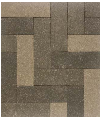
Denali Plank Series Pavers