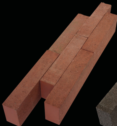
PAWNEE RED EDGE SET