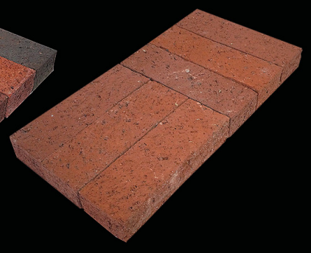
PAWNEE RED FLAT SET