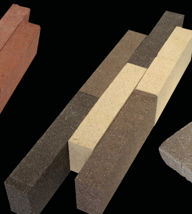
FIELD GRAY : SEAL BROWN : 481-483