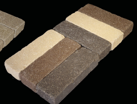
FIELD GRAY : SEAL BROWN : 481-483 TUMBLED

Due to printing limitations, the color of the brick panels may be slightly different than those represented. We encourage that you request a sample for color matching applications.