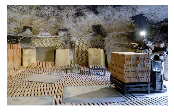
In this beehive kiln—a round brick structure wrapped with steel bands to control heat expansion—bricks are stacked with narrow spaces between them so that heat will circulate completely around the product.

Aside from having loyal employees, The Belden Brick Co.'s longevity is a testament to its ability to anticipate fluctuating consumer needs and adapt to industry advancements. Diversification in terms of manufacturing capabilities, product offerings, and distribution areas—as well as heavy investments in technology over the past two decades—has kept the company afloat.