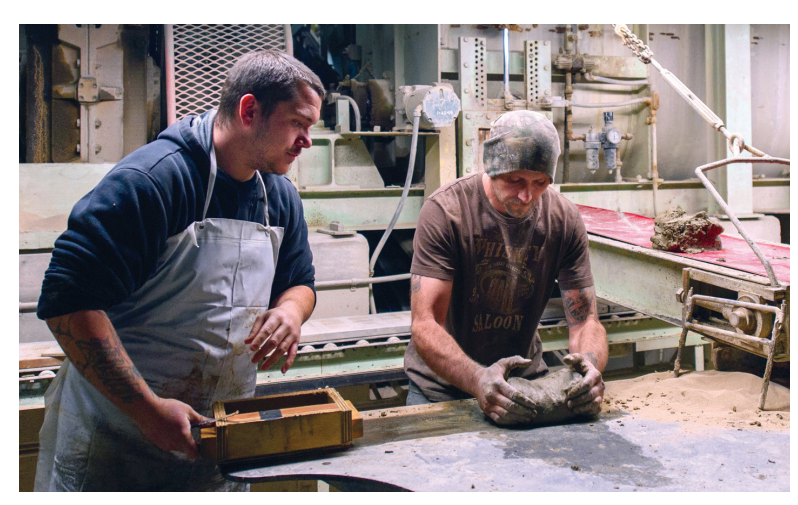
Artisans from The Belden Brick Co.'s Special Shapes Division form bricks by hand, providing custom-tailored design options that fit the end-user's exact needs.